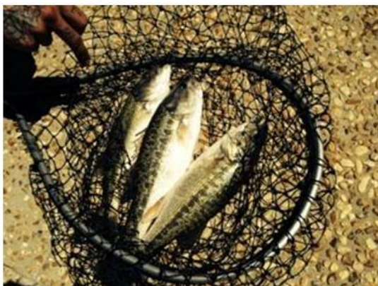
Spotted Bass continue to be the most caught fish at Lake Nacimiento

Catfish are doing well at both lakes, using worms, frozen Shad or Anchovies produces the best results.