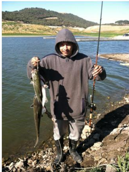
Catfish and Smallmouth Bass are biting at Lake San Antonio, fish off the shore or drop a hand launched vessel like a kayak or canoe.