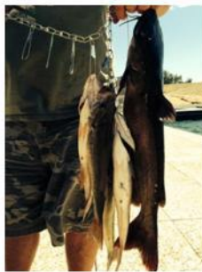
Catfish caught at Lake Nacimiento using Crappie Jigs of all things.

Spotted Bass this size are being caught daily at Lake Nacimiento. Using Rooster Tails or other small spoons, top water lures like Poppers, or small swim baits are enticing these regularly.