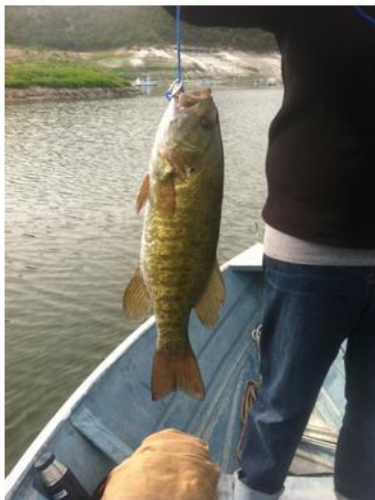
Smallmouth Bass caught at Lake San Antonio across from moored Marina on swim bait.