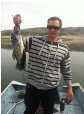
Crappie are still biting at Lake San Antonio, these 2 whoppers caught on 4/21/14 using a Rat L Trap and swimbait.

As always we would love to hear your fish tales! Please come in to the Marina or Store and tell us your tale, providing pictures would be highly appreciated!